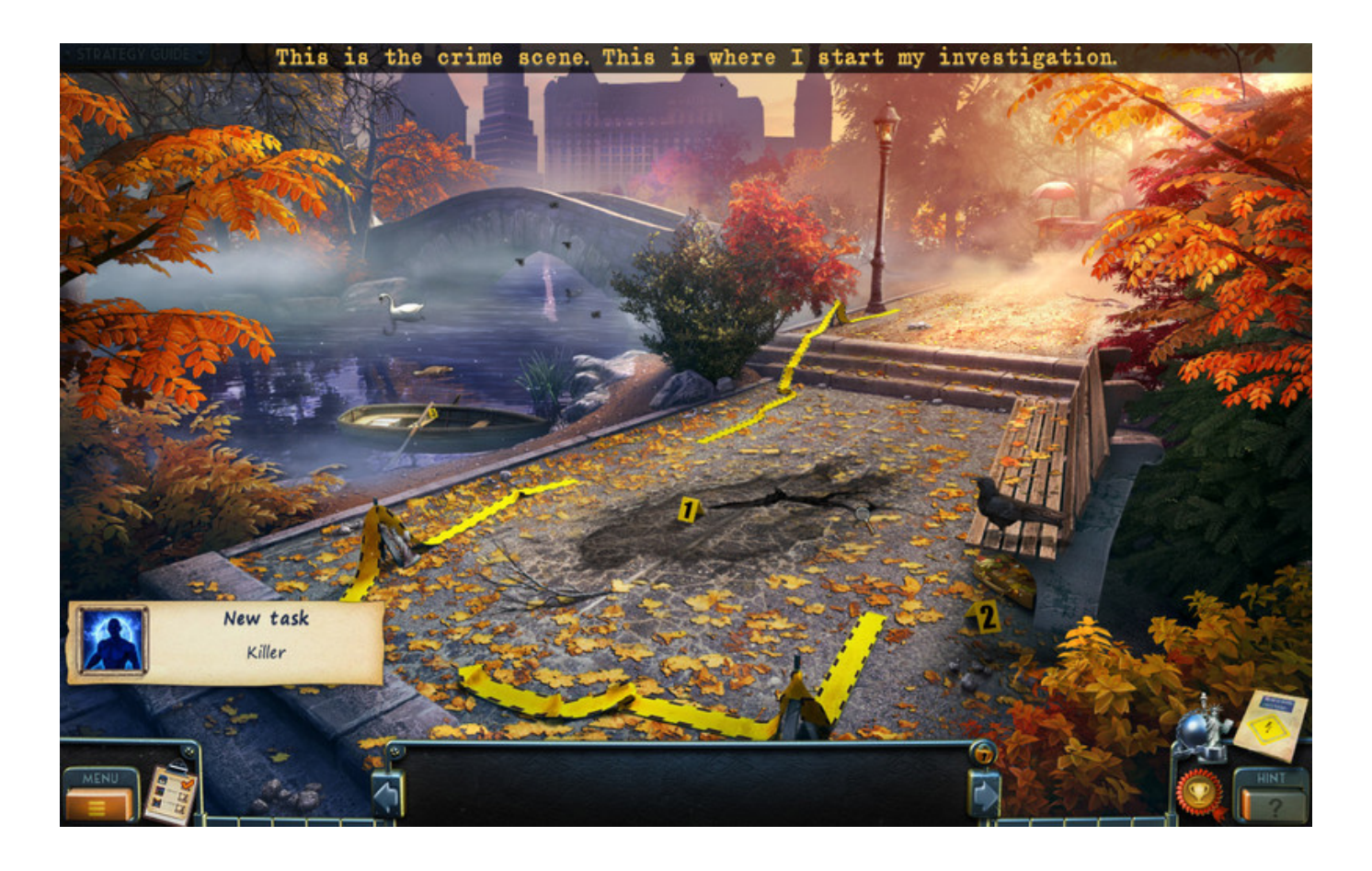
Download ->>> <a href="http://bit.ly/2NLv7Se">http://bit.ly/2NLv7Se</a>